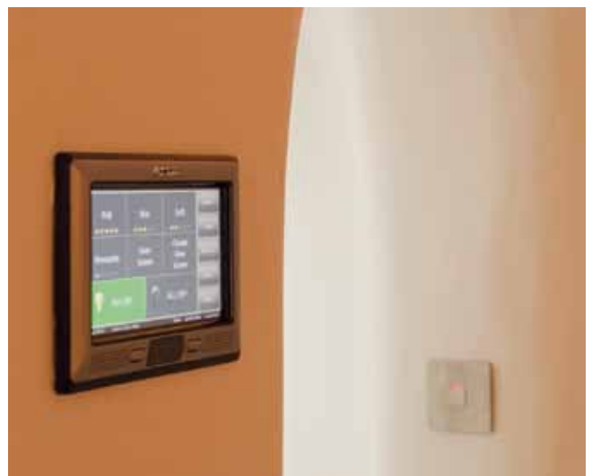
Wall-mounted AMX touchpanels give guests fingertip control for their comfort and convenience