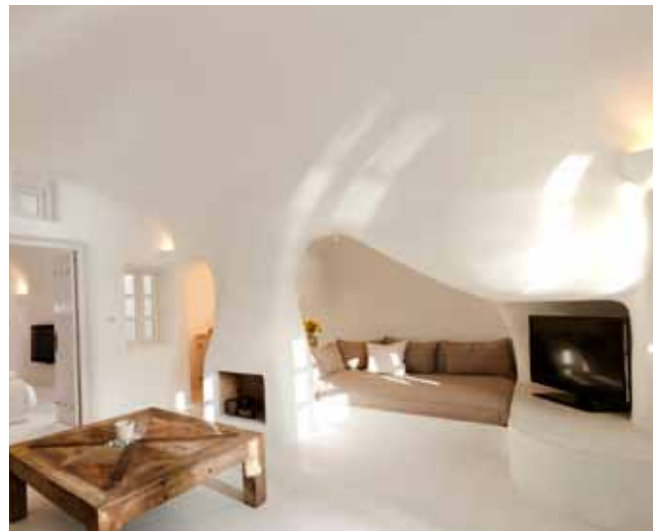
Technology has been seamlessly integrated so as not to detract from the minimalist interior