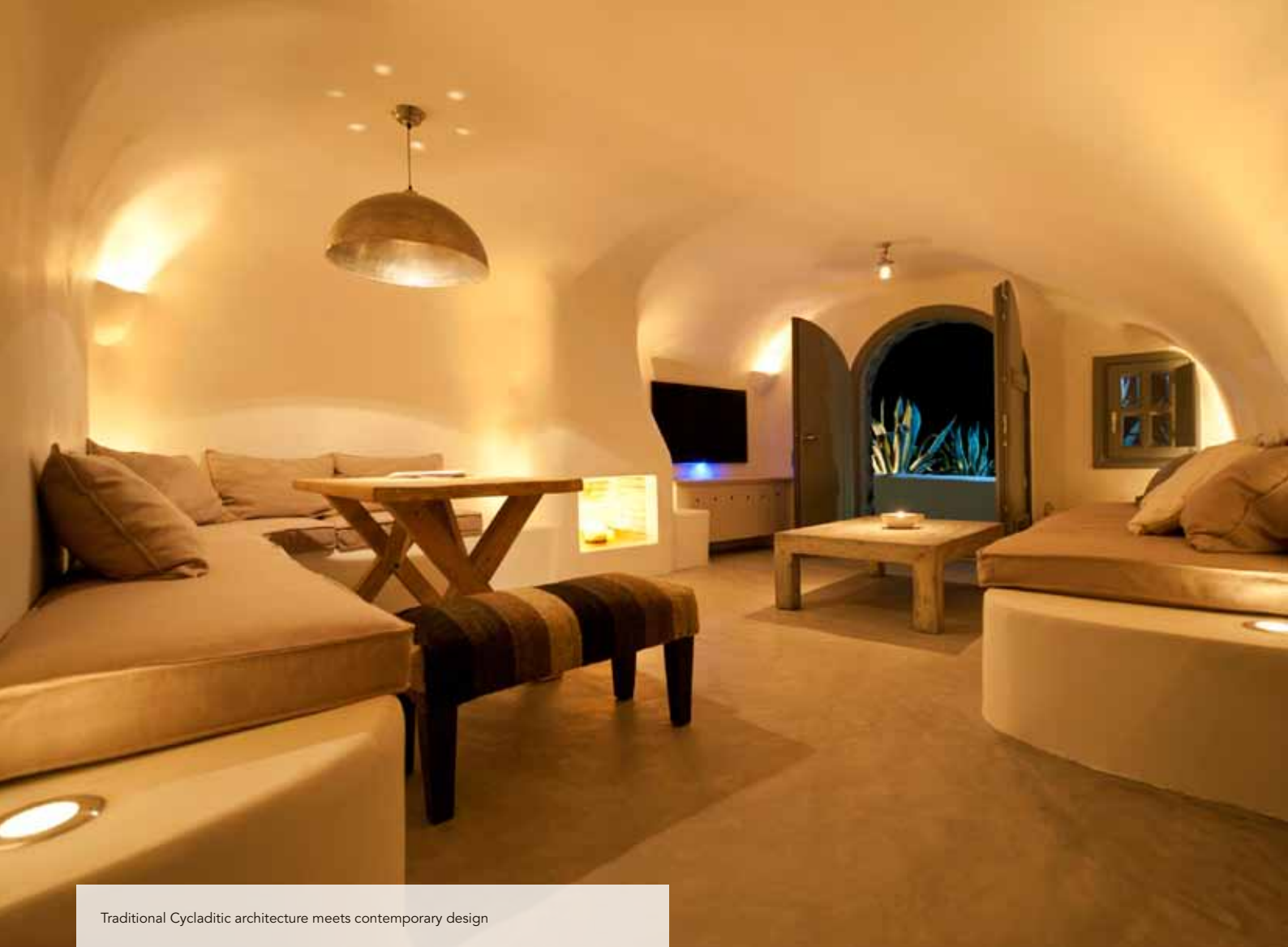
Traditional Cycladic architecture meets contemporary design

Perched dramatically on volcanic rock, 380 metres above sea level, the Kapari Natural Resort in Santorini commands unrivalled views of both the caldera and the island's famous sunsets, reputed to be amongst the most beautiful in the world. Comprised of a collection of 300 year old traditional dwellings that were all but destroyed in an earthquake in the mid 1950s, the Kapari has been meticulously restored and brought firmly into the 21st century with an enviable, five star specification. Combining traditional design with modern technological convenience, the Kapari's AMX-driven automation systems have been seamlessly integrated so as to ensure that this cliff-top retreat is equally well positioned to meet the technological needs of today's discerning guests.