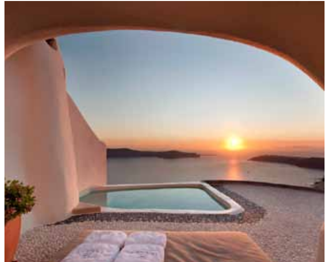
AMX technology ensures that the Kapari experience is every bit as memorable as the sunset!

With its bespoke charm and high-tech specification, the Kapari is a showcase for how innovative AMX technology can add value to a hospitality offering. This comprehensive and unified solution enhances full facility management, increases guest satisfaction and affords an important competitive advantage, all the time ensuring that the Kapari experience is every bit as memorable as the sunset!