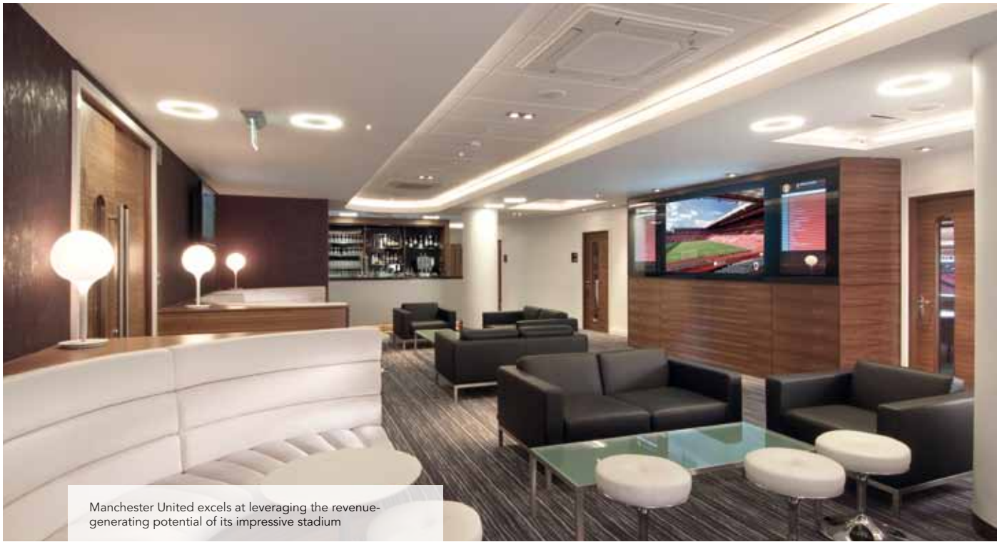
Manchester United excels at leveraging the revenue-generating potential of its impressive stadium